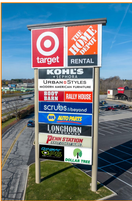
Pylon Sign 1