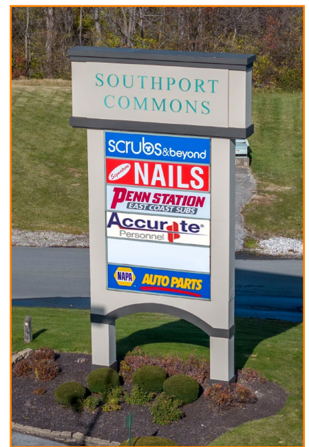
Pylon Sign 3

Information deemed reliable, but not guaranteed. Subject to change without notice.