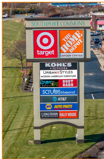
Pylon Sign 2