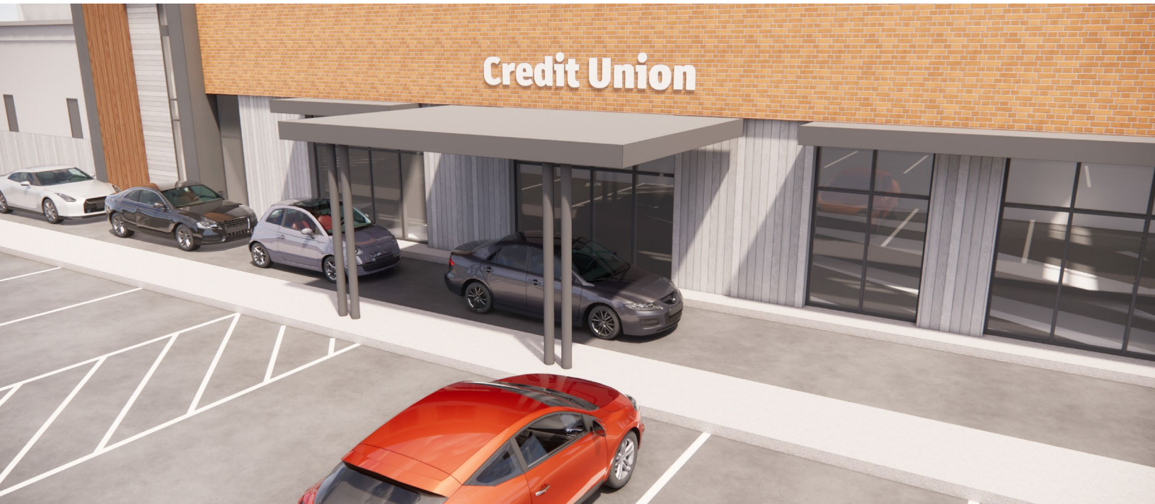
Southern Elevation - Proposed Drive Thru

Information deemed reliable, but not guaranteed. Subject to change without notice.