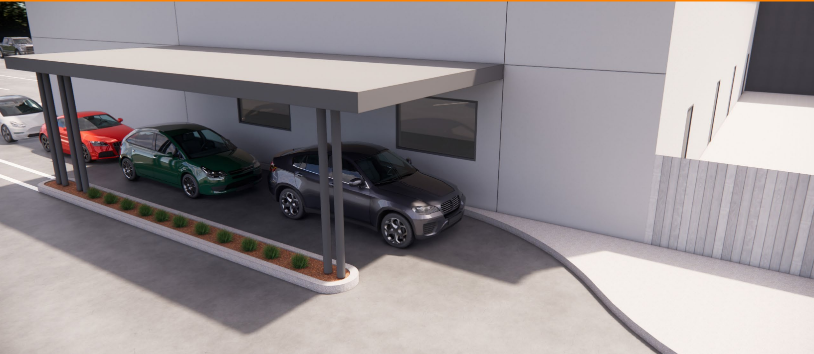
Western Elevation - Proposed Pickup Window

6100 N Keystone Ave | Indianapolis, IN 46220