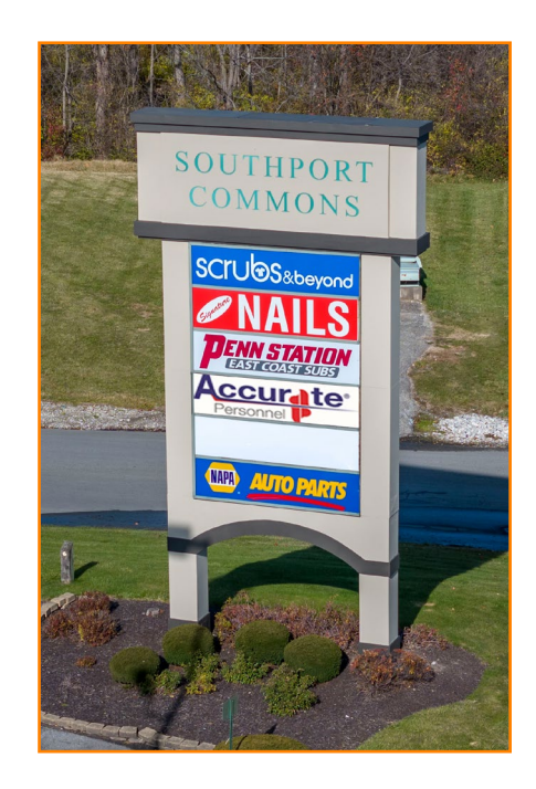
Pylon Sign 1